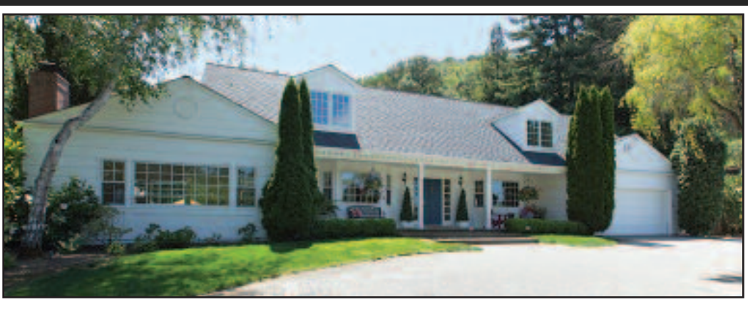
18 Springhill Lane, Lafayette

5 bedroom + office, 4.5 bathroom, 4070± sq. ft. home on .69± acres.